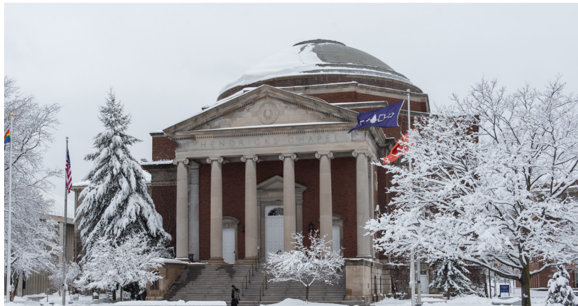
Hendricks Chapel, Syracuse University

Materials and instructions are made available to Syracuse University Project Advance instructors and to the designated SUPA coordinators in the high school. To register for Syracuse University credit, students must apply to register online at pass.supa.syr.edu . High schools should instruct their students to include all courses they wish to regis-